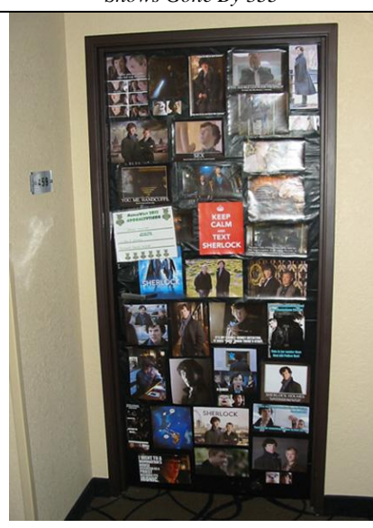
Best Humor Stay Calm and Text Sherlock 459