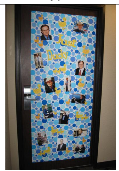
Best Character Just Ducky 280