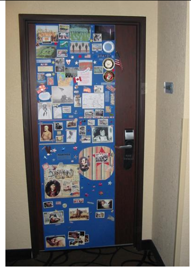
Most Patriotic Dreaming of Heroes 445