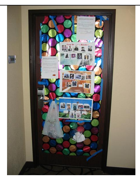
Best Interactive Fantasy Fantasy Team 508