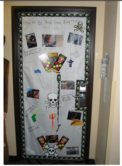
Best Single Fandom Mystery Spot 507