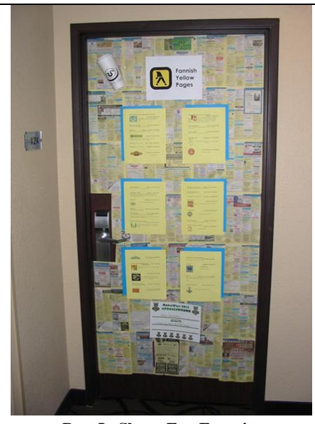
Best In Show, Fan Favorite Yellow Pages 424