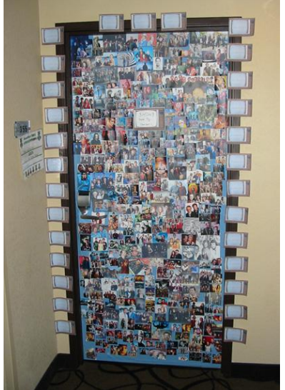
Best Multi-Fandom Shows Gone By 355